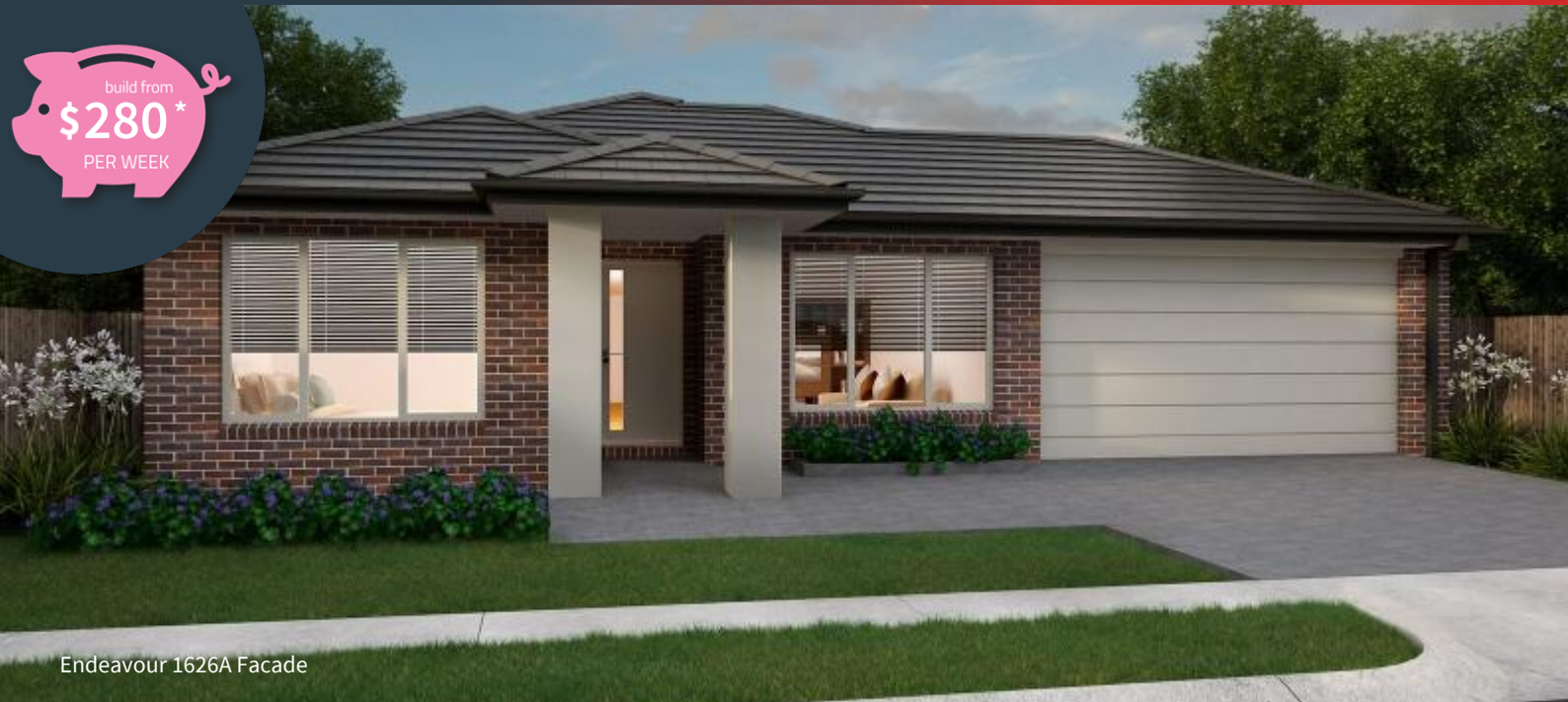
Endeavour 1626A Facade