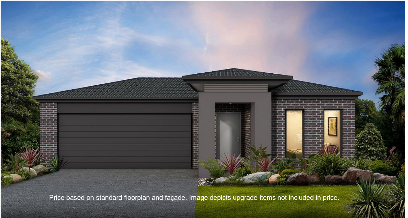
Price based on standard floorplan and façade. Image depicts upgrade items not included in price.