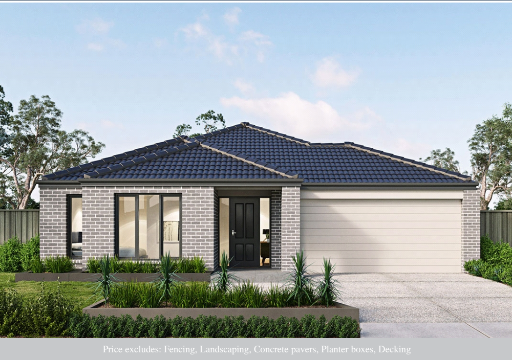
Price excludes: Fencing, Landscaping, Concrete pavers, Planter boxes, Decking