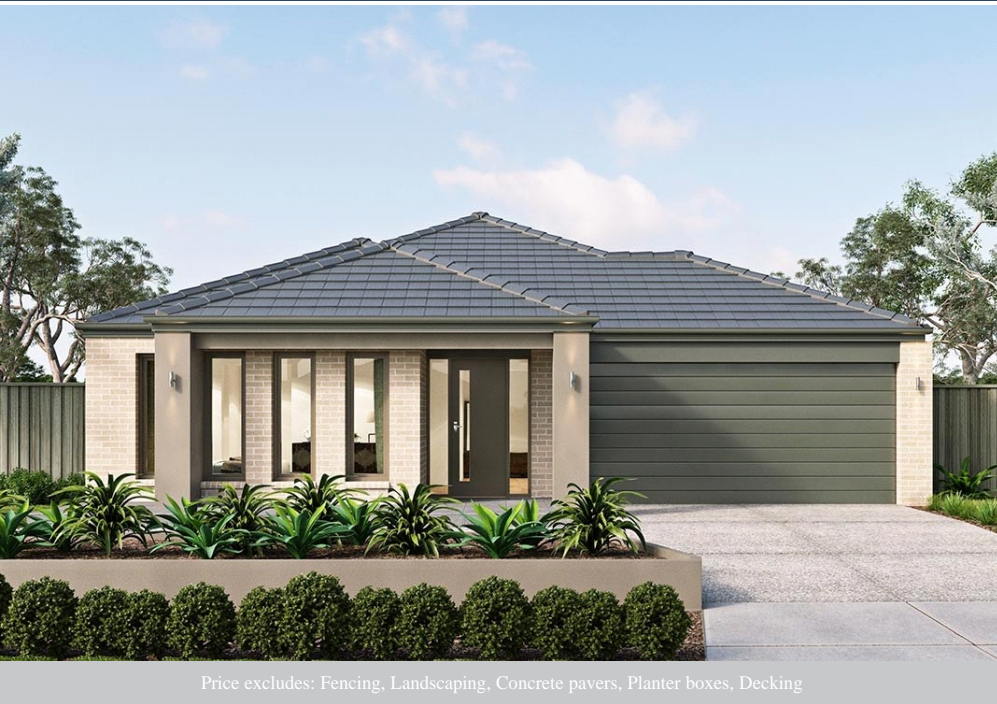
Price excludes: Fencing, Landscaping, Concrete pavers, Planter boxes, Decking