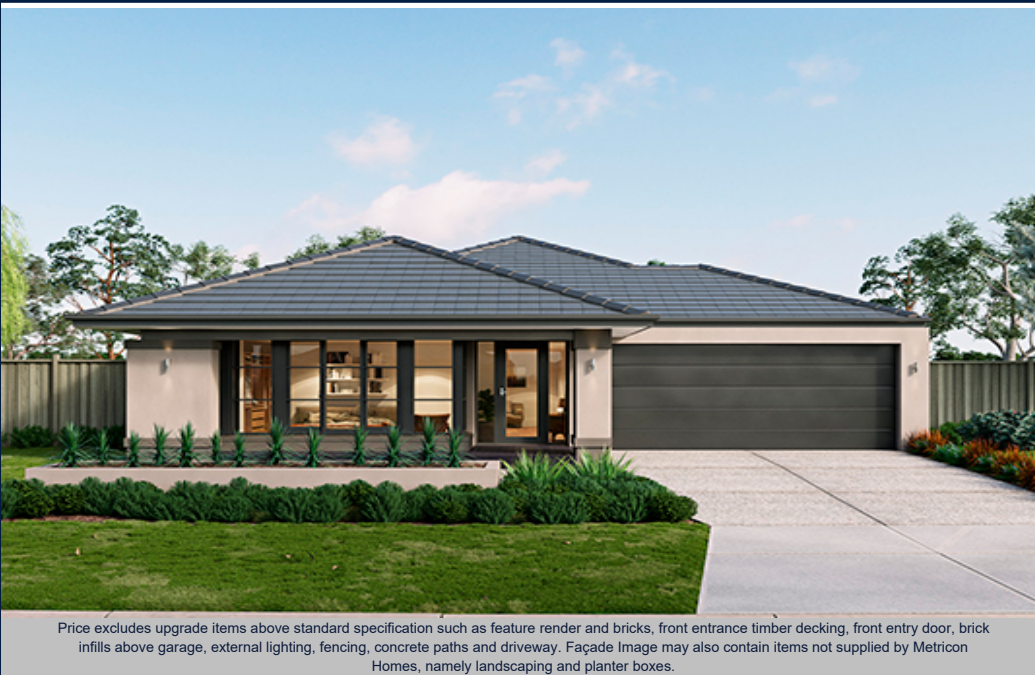
Price excludes upgrade items above standard specification such as feature render and bricks, front entrance timber decking, front entry door, brick infills above garage, external lighting, fencing, concrete paths and driveway. Façade Image may also contain items not supplied by Metricon Homes, namely landscaping and planter boxes.