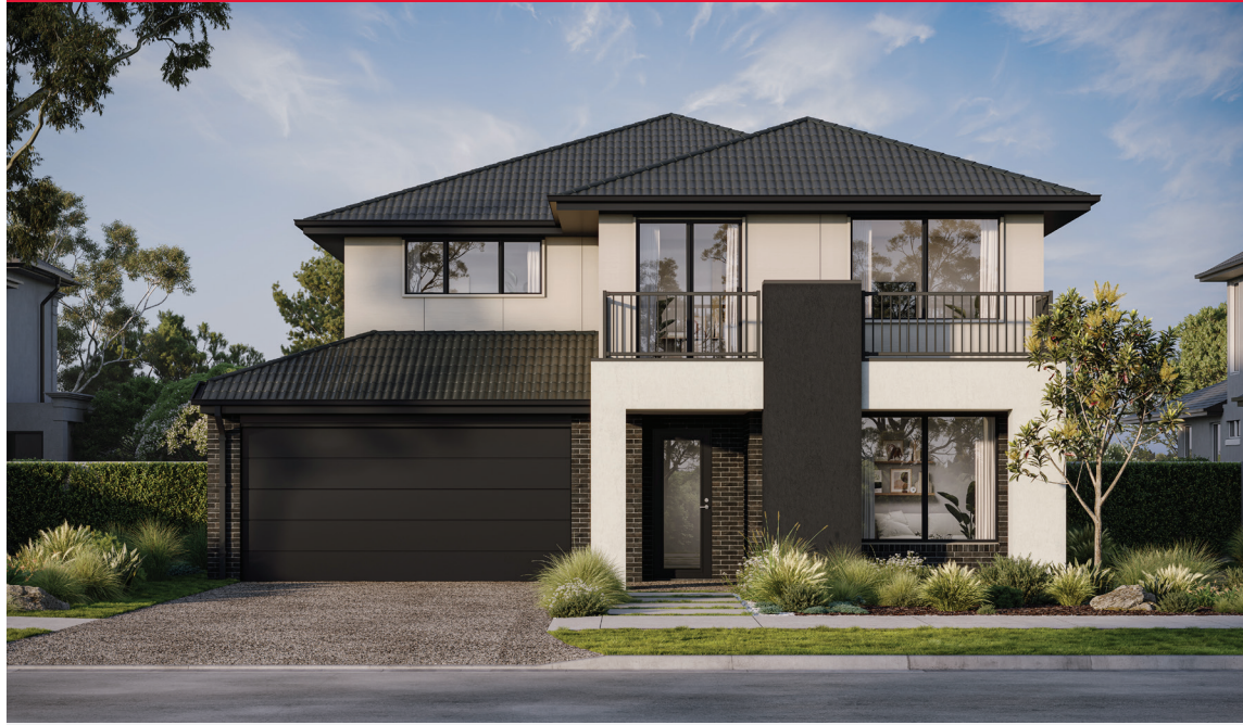
ARMIDALE 34 | ELEVATE RANGE