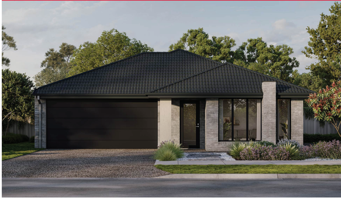
SMITHFIELD 25 | ELEVATE RANGE