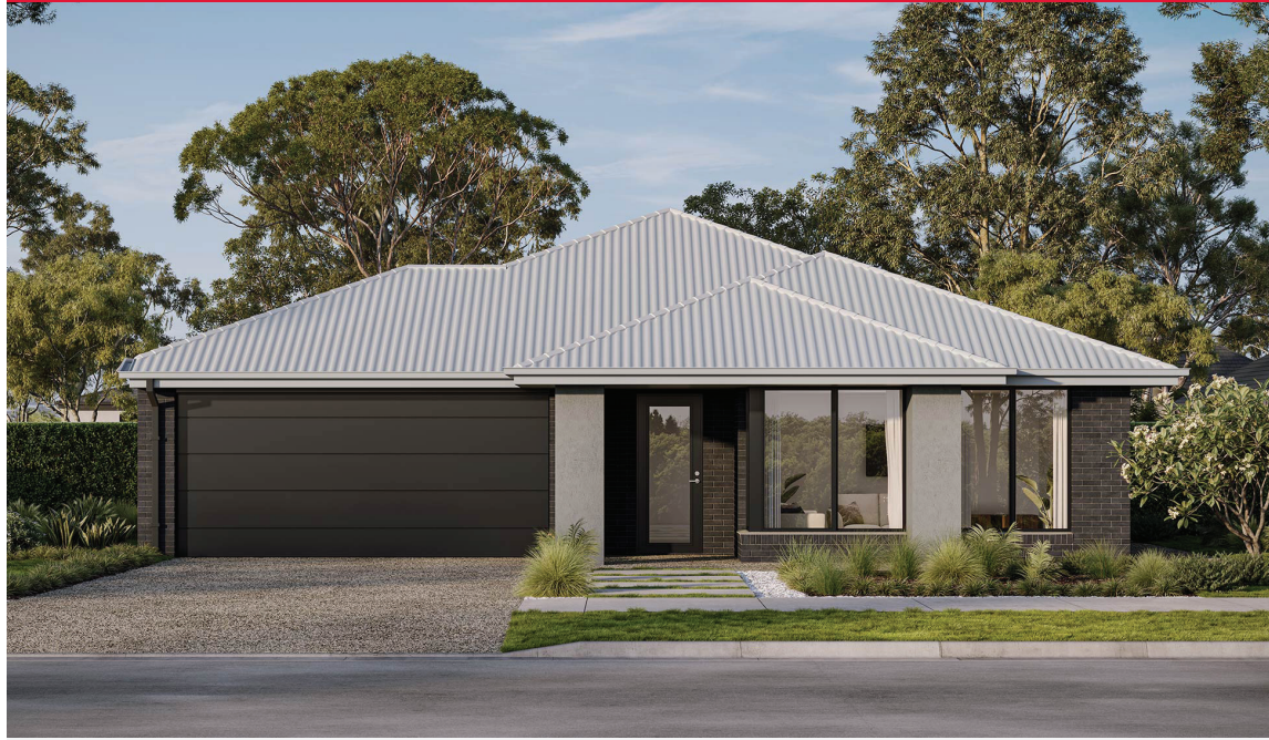
HEPBURN 25 | ELEVATE RANGE