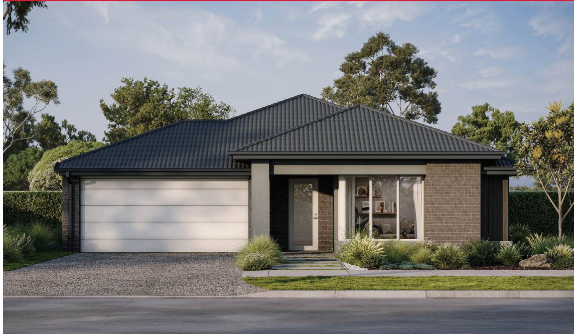
BERRIMA 28 | ELEVATE RANGE