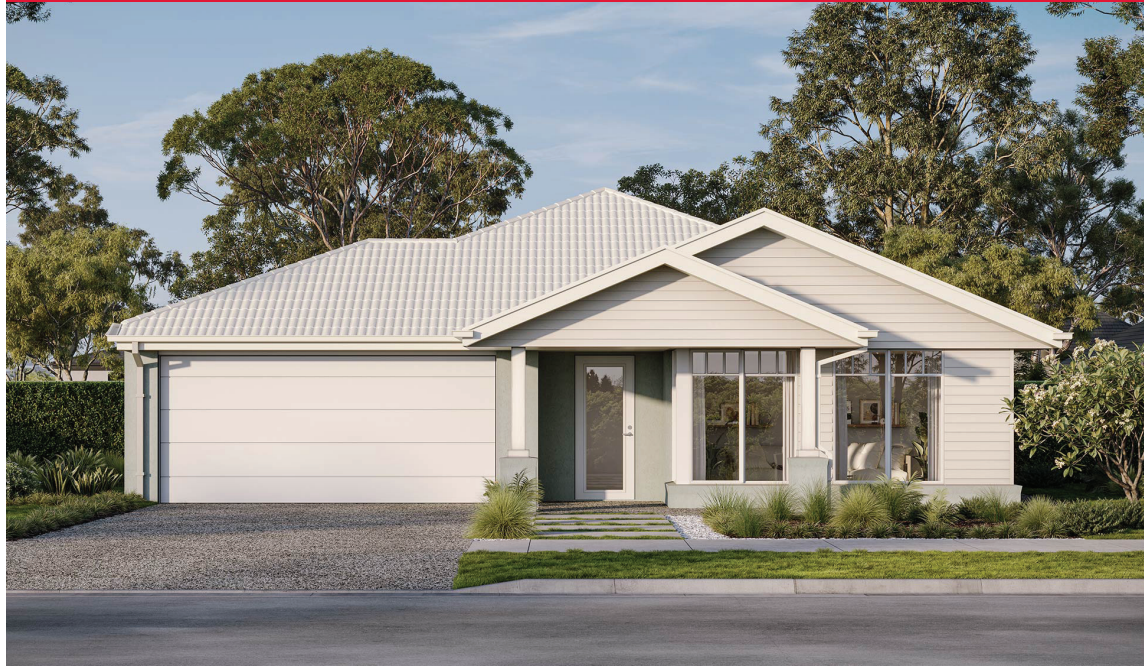
GRANITE 25 | ELEVATE RANGE