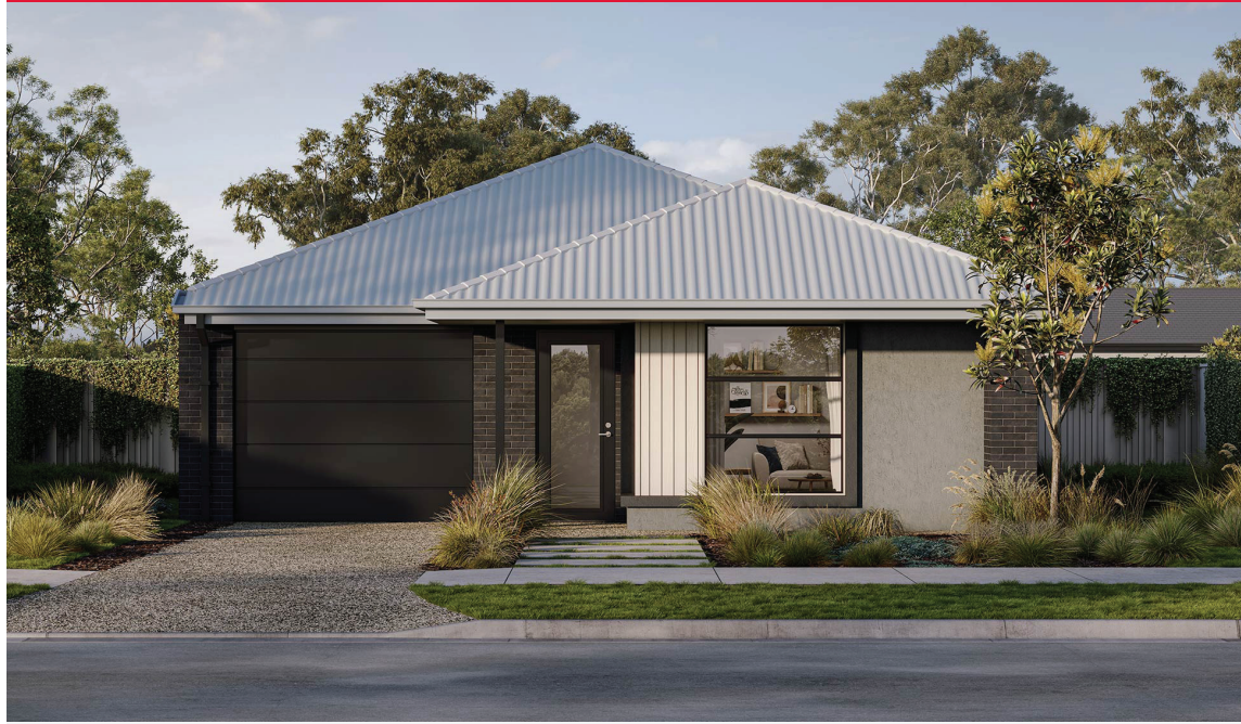
MURRAYA 20 | EMERGE RANGE