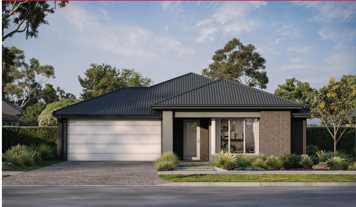
BERRIMA 28 | ELEVATE RANGE