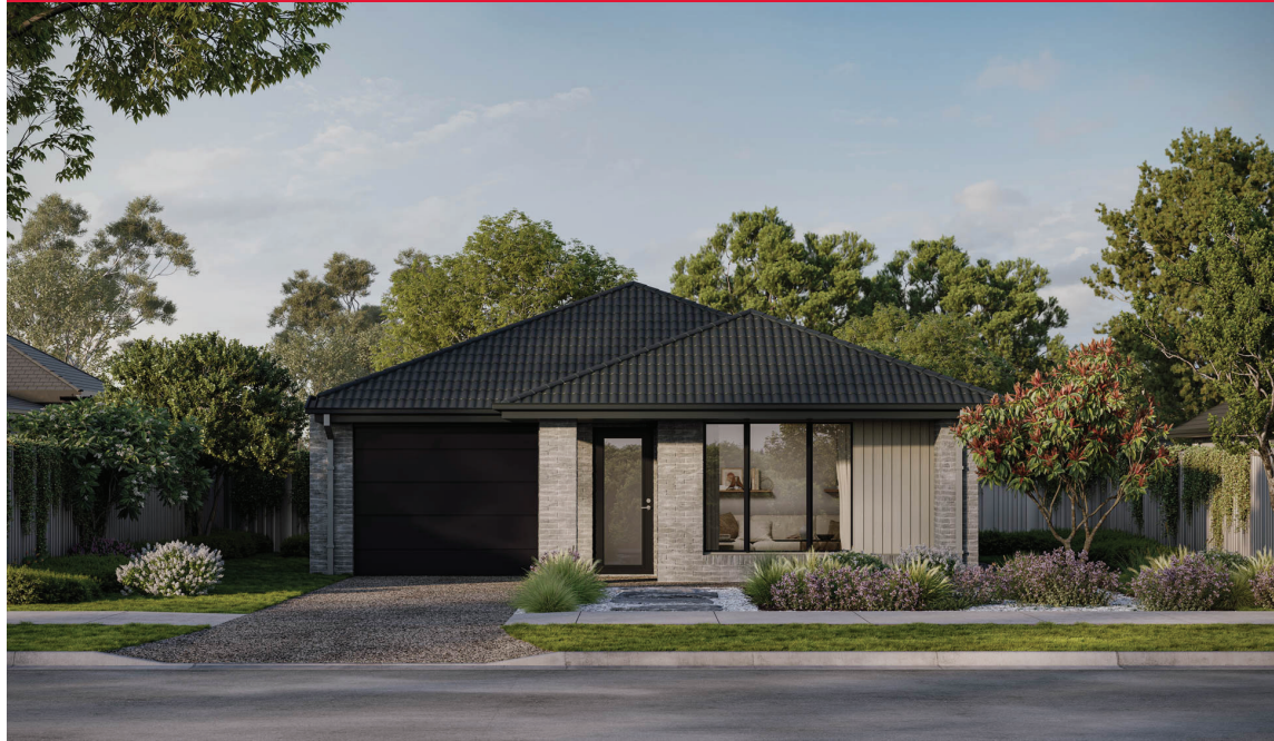
MURRAYA 20 | EMERGE RANGE